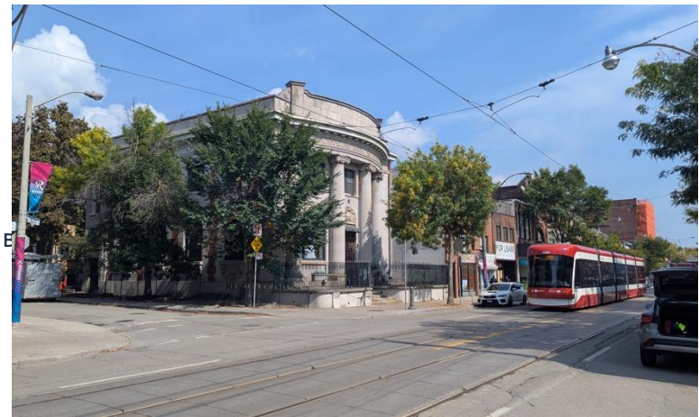
Queen Street East