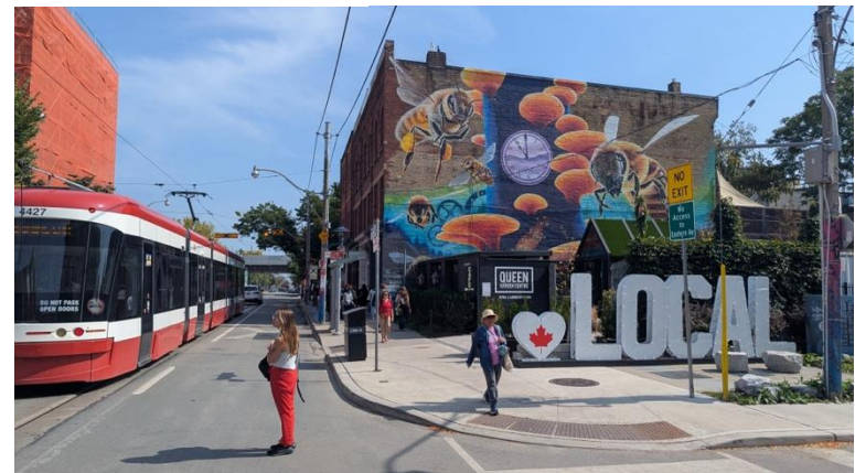
Saulters Street – Queen Garden Cafe